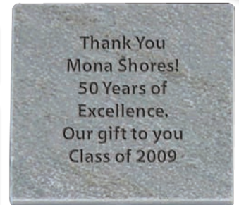
6 Line, 16"x 16" Brick